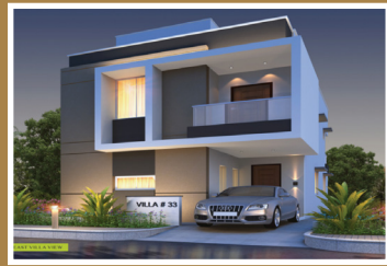
OORJITA RALI GRAND @ YAPRAL