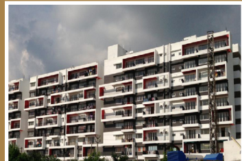
TRIDENT GRANDE @ KOMPALLY