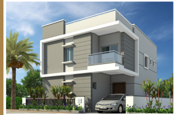
OORJITA GRAND VIERA @ KOMPALLY