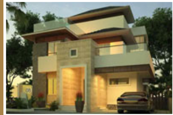
OORJITA ISTANA @ GANDIPET