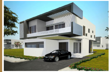
OORJITA GRAND VIE @ KOMPALLY