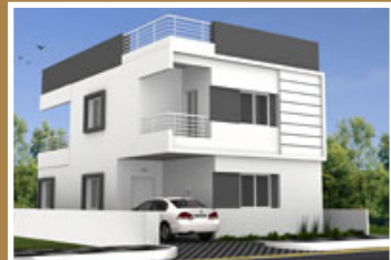
OORJITA GRAND VIE-II @ KOMPALLY